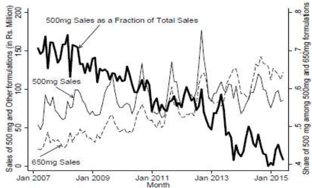
Figure 2. The sales of 500mg and 650mg Paracetamol over time

Figure 2 Notes: The sales of 500mg Paracetamol declined relative to the sales of 650mg Paracetamol during the study period.